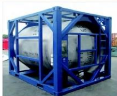
Horizontal Offshore Tank