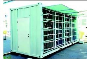
Data Center Container