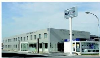
Modular Container Hotel