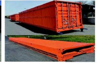
40 ft Foldable Container