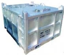
Offshore Mud Skip With HDG Surface