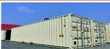
ISO 40GP Dry Cargo Container