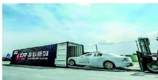
External Passenger Car Transport Rack