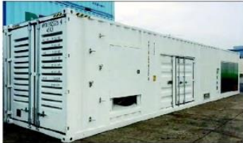
Mobile Power Equipment Container