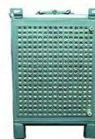
IBC with Cooling Jacket