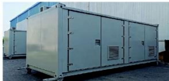
Hydrogen Energy Storage container