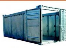
OT Offshore Container with HDG Surface