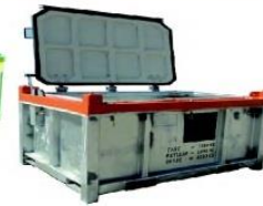
Offshore Tool Box