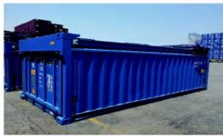
20 ft Half Height Bulk Cargo Open Top Container