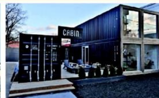
Modular Container Residential House