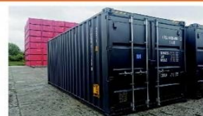
ISO20HC Dry Cargo Container