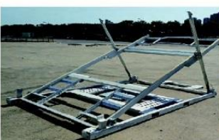
External Passenger Car Transport Rack (SUV Specialized)