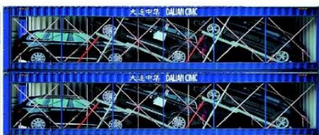
External Passenger Car KD Piece Transport Rack