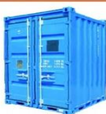
Mini Container With Middle Shelf