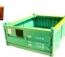
Half Height Offshore Container