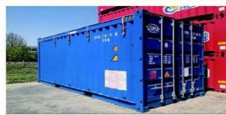
Steel Coil Container