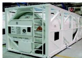
20ft' Offshore Tank