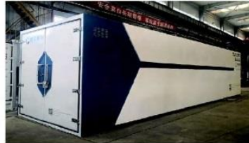
Wastewater Treatment Container