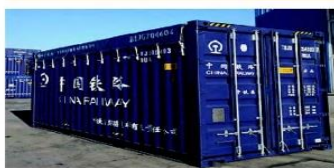
35t Open Top Container (2550/2438 mm wide)