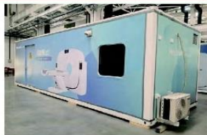
Mobile Medical Container