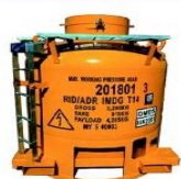
UN T14 Vertical Portable Tank