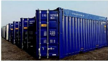
Composite Lightweight Open Top Bulk Container