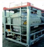
Heli-fuel Offshore Tank