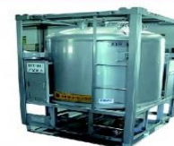
IBC For Paint