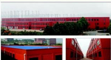
Modular Container Office Building