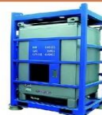
Vertical Offshore Tank