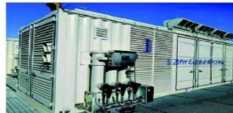
Energy Storage Peaking Power Station