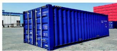
30t Open Top Container (2438 mm wide)