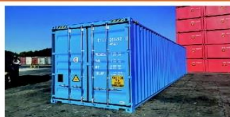
ISO 40HC Dry Cargo Container