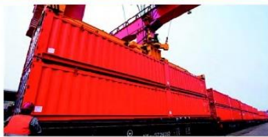
40 ft Half Height Bulk Cargo Open Top Container