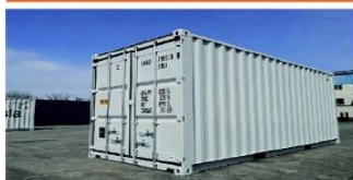
ISO 20GP Dry Cargo Container