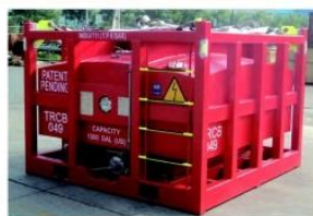
Square Offshore Tank