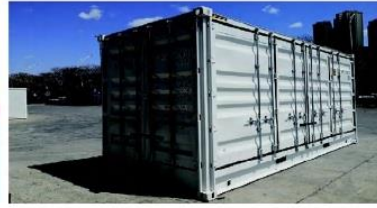
Side Open Container