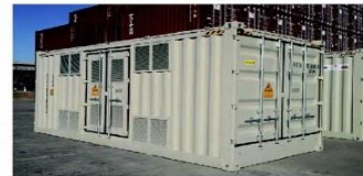
Generator / Voltage Transformer Container