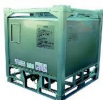
IBC For Dangerous Liquid