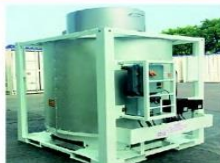
UN T11 Horizontal Explosion-proof heating Portable Tank