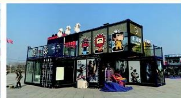
Modular Container Town