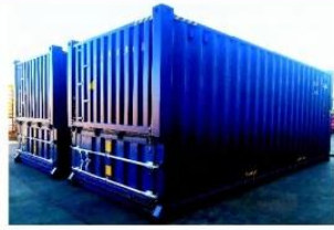
Bulk Container (for Grain, Fertilizer, Sulphur ,etc)