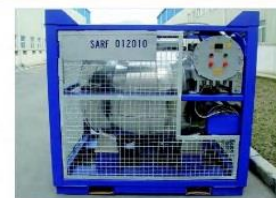
Vertical Offshore Tank With Heating Insulation System