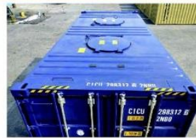
Aluminum Oxide Container