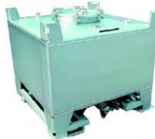
IBC With Heating Jacket