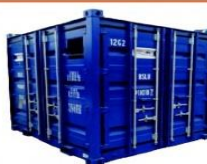
Side Open Offshore Container