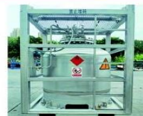
Spacecraft Fuel Filling Tank