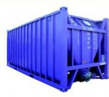
20ft Powder Tank Container (PTA, etc)