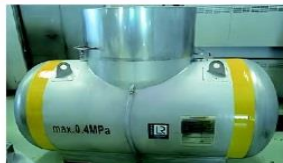
UN T14 Horizontal Portable Tank