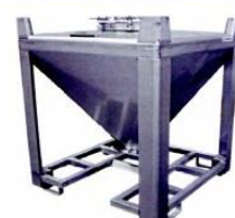
IBC for Chemicals Powder