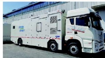
Mobile Medical Unit