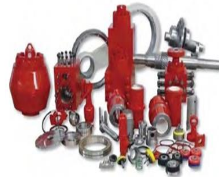
For Mud pump